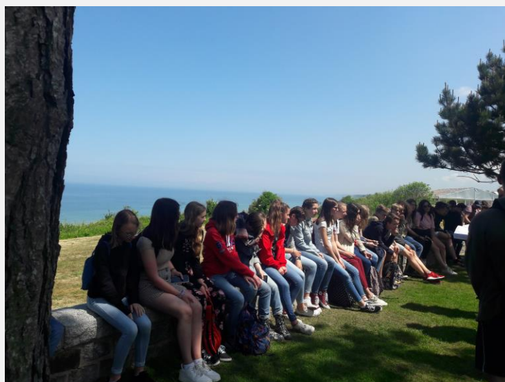
the project group at Omaha Beach