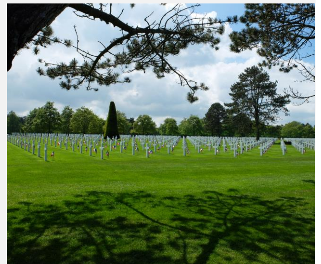
the American military cemetery at Colleville