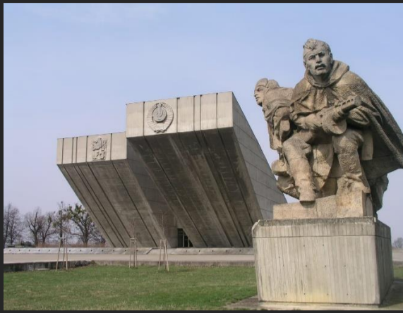
The war memoral at Hrabyňě